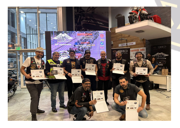
Appreciation certificates were given to Qatar Chapter Committee Officers.

Harley Owners Group was created in 1983 as a way to build longer lasting and stronger relationships with Harley-Davidson Bikers. Our Chapter together with our Sponsoring dealer Harley-Davidson Doha celebrated The 40th Anniversary of the International Harley Owners Group. The event included welcoming of bikers from different Motorcycle Clubs in Qatar, trophies were distributed to sponsors of the events and for the former Qatar Chapter Directors, and appreciation certificates for all current Qatar Chapter Committee Officers. Raffle tickets and prizes were distributed to event attendees.